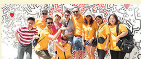
No. of Members