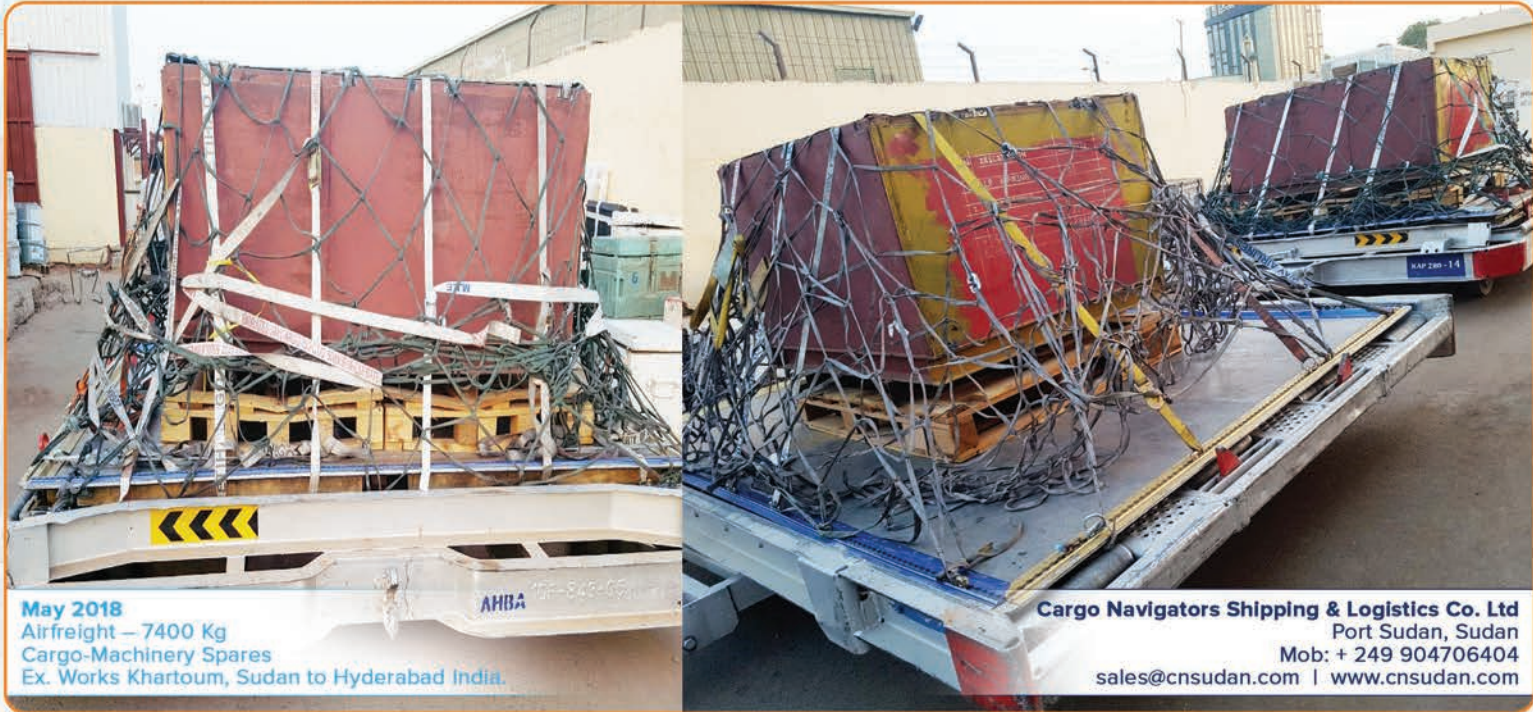
May 2018 Airfreight – 7400 Kg Cargo-Machinery Spares Ex. Works Khartoum, Sudan to Hyderabad India.