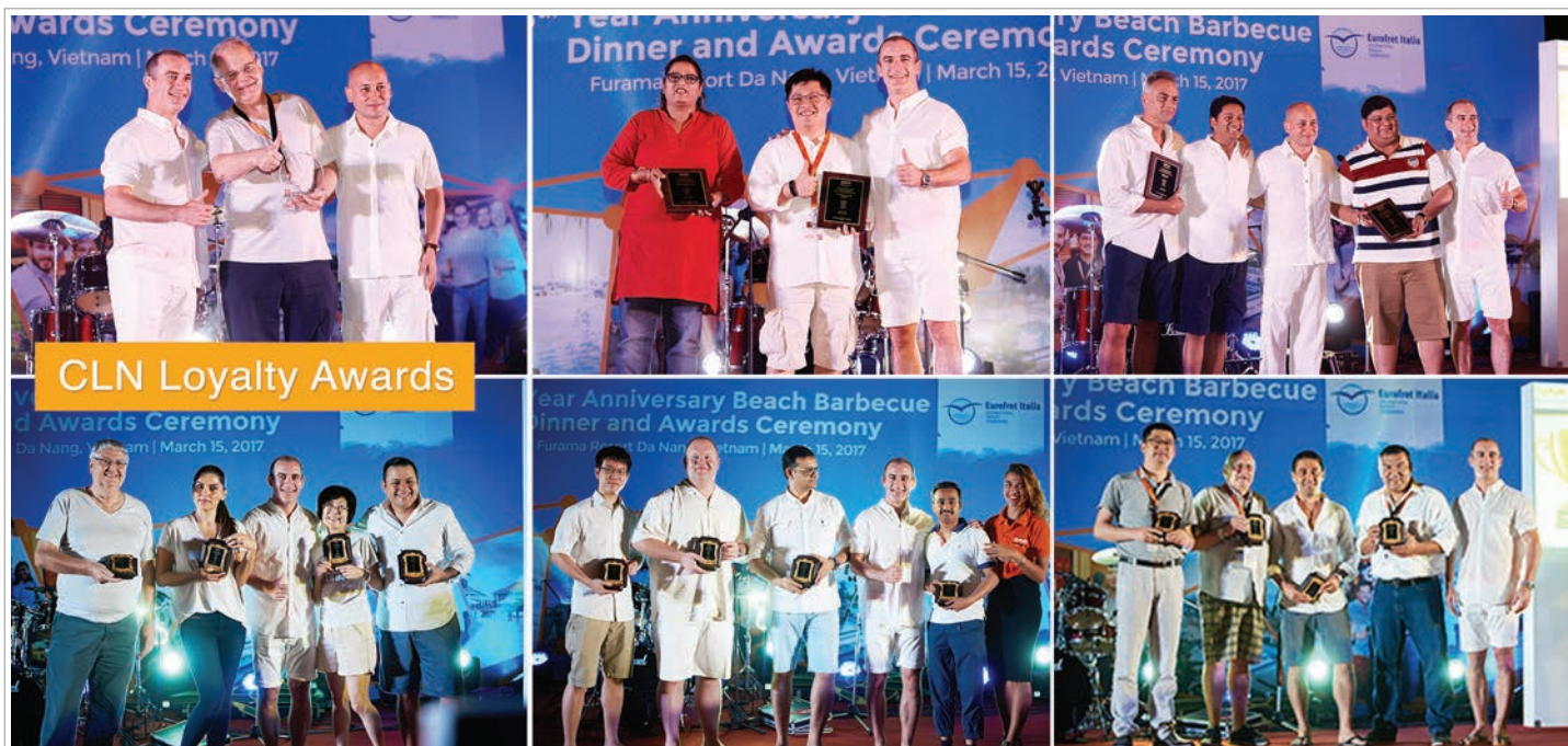
CLN Loyalty Awards

The CLN Loyalty Awards were handed out as well to members who have been with the network for 3 years, 5 years, 8 years, 10 years, and a special mention to our honorary members who have been with the network for over 15 years now.